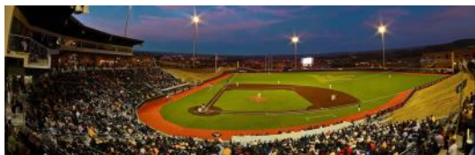
Monongalia County Ballpark - WVU Baseball 2,500 Seats