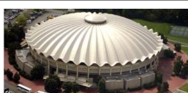
WVU Coliseum - WVU Basketball 14,000 Seats