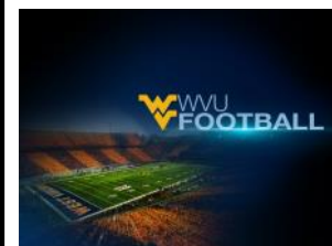
Milan Puskar (Mountaineer) football Stadium 60,000 seats