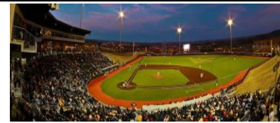
Monongalia County Ballpark - WVU Baseball 2,500 Seats