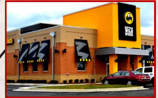
Buffalo Wild Wings Grill and Bar